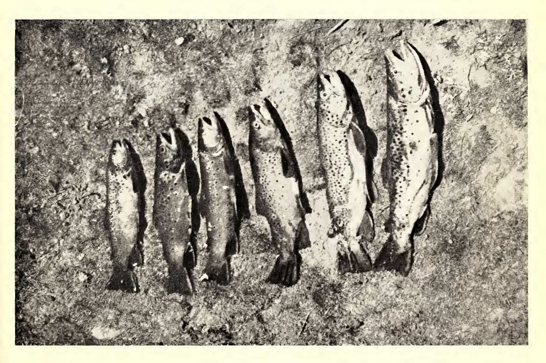
My last day—upper Naubug. Best 3\frac{1}{2} lbs.